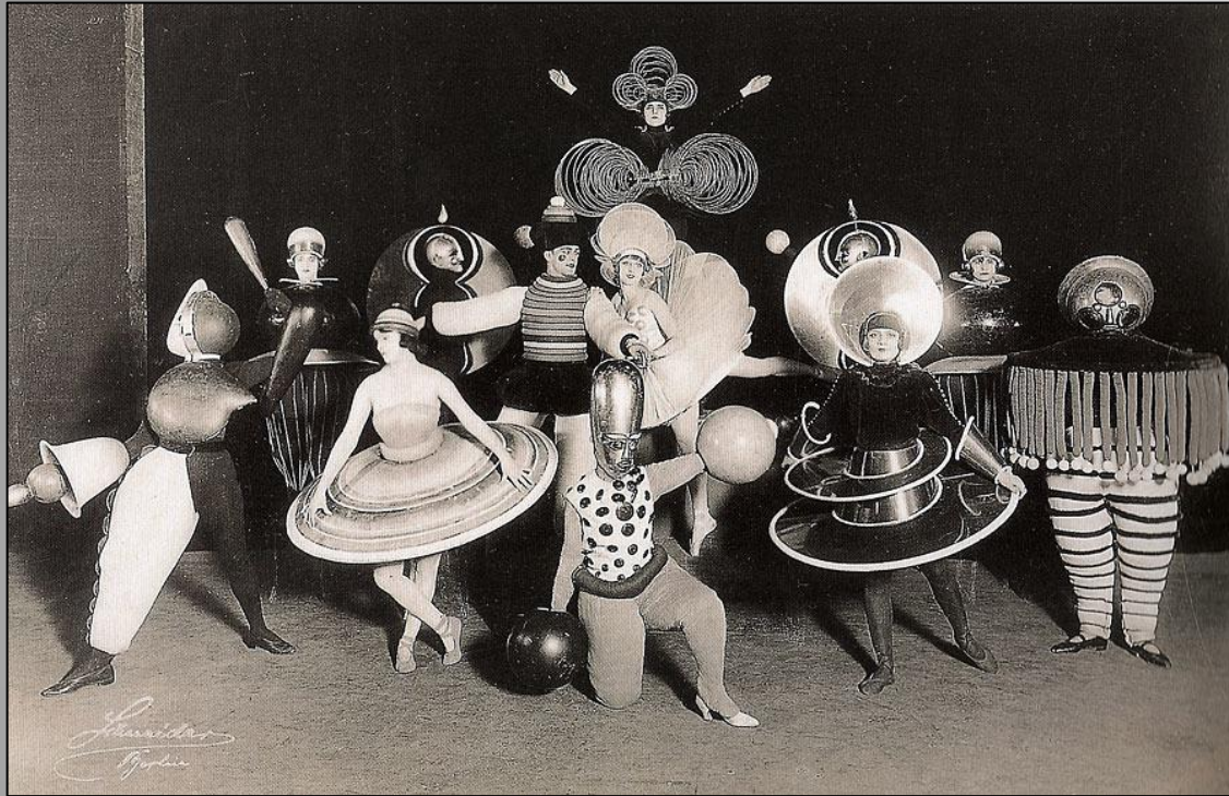
Oskar Schlemmer, Triadisches Ballett , 1922